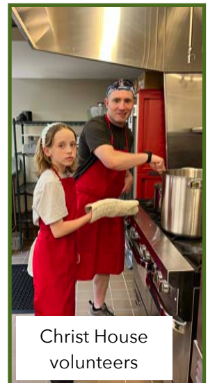
Christ House volunteers