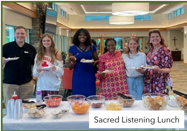
Sacred Listening Lunch