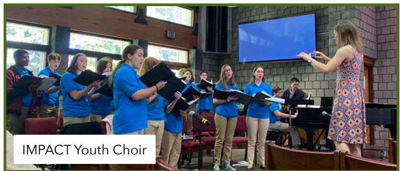
IMPACT Youth Choir