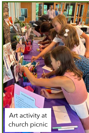
Art activity at church picnic