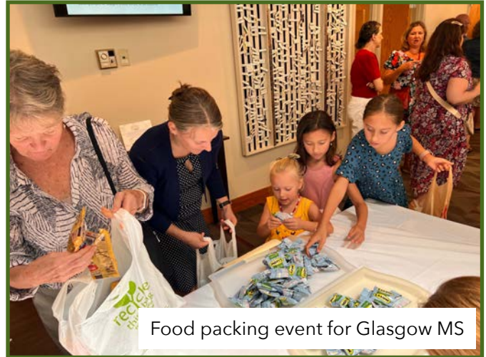
Food packing event for Glasgow MS