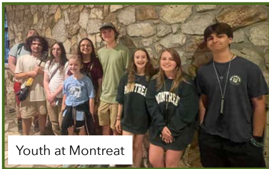
Youth at Montreat