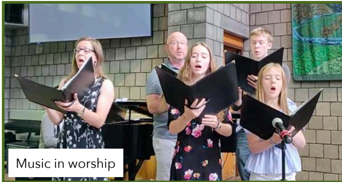
Music in worship