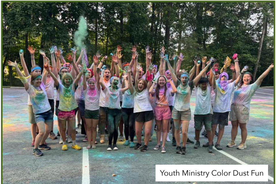
Youth Ministry Color Dust Fun