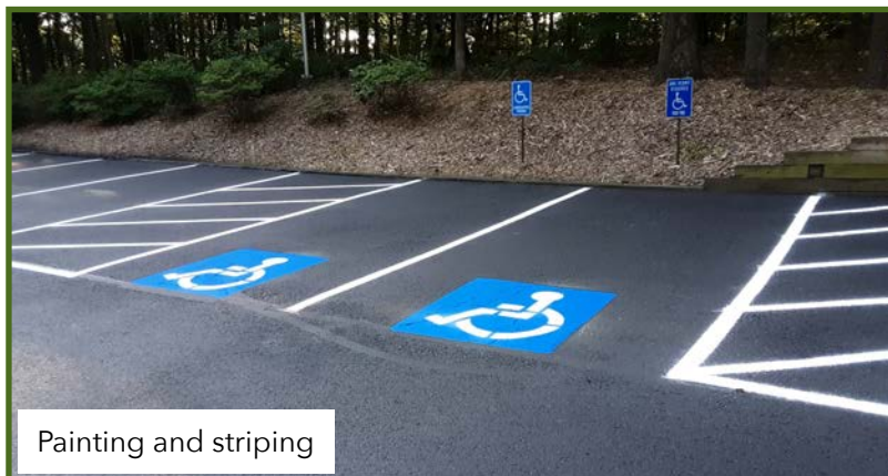
Painting and striping