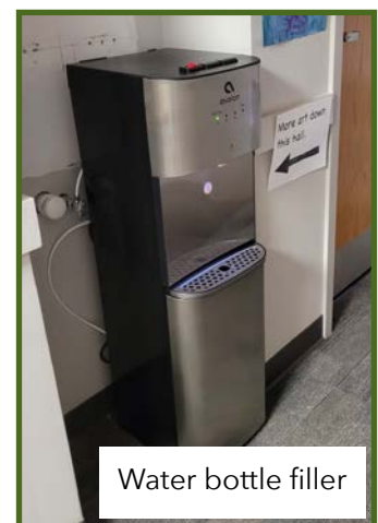
Water bottle filler